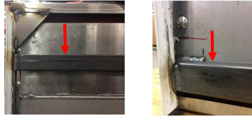
Figure 1 – Front and Rear Hood Tubing